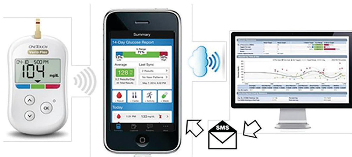
FIGURE 2 Subject data flow. Test (baseline to week 24) and control (week 12 to week 24) subjects used the OT Verio Flex meter to conduct BGM according to the schedule suggested by their HCP. BGM data were transmitted wirelessly from the meter to the smartphone containing the Spanish-language version of the diabetes management mobile app OT Reveal. BGM data were automatically uploaded via the Cloud to a Web-based version of the app accessible to the HCPs on their office computers. HCPs reviewed the 14-day Web-based report for each subject to assist in formulating diabetes-related text messages sent to the subjects' smartphone.

had type 2 diabetes, and 95% were of Hispanic or Latino ethnicity. Nearly all had never used diabetes management software or had their HCP download their blood glucose data from their meter. More than half of the subjects had either no formal education (16%) or only primary school education (50%); 32% had some secondary or technical school training, and only 2% had some college education. More than half of the subjects listed either home management (33%), farming, fishing, and forestry (11%), or construction/maintenance (8%) as their occupation. Sixty percent of patients were on oral medication, and the remainder were using mealtime or basal insulin. Seventy of the 120 subjects were provided smartphones. Loading of the app on the phone was done by clinic staff in about 85% of the cases. Synchronizing of blood glucose data were automatic each time the subject opened the app.